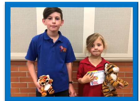
PBL Bear Recipients