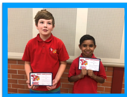
Merit Award Recipients