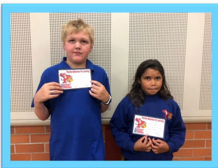
PBL Award Recipients

This also is the case for students leaving and returning to school during the school day.