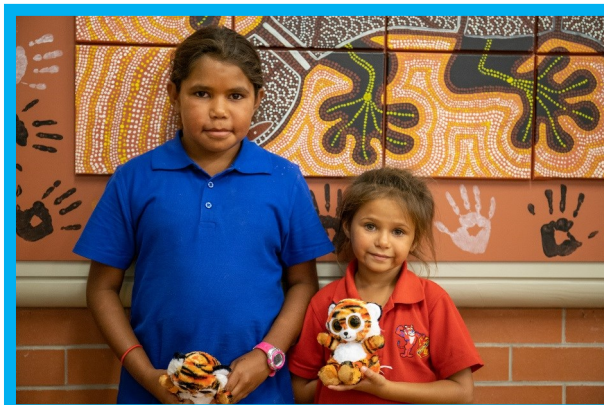
PBL Bear recipients