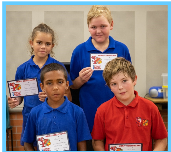
Primary Merit Award recipients