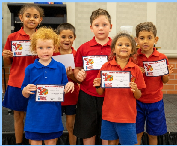
Infant Merit Award recipients