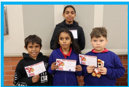
Merit Award Recipients