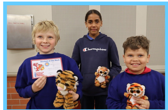
Student of the Week & PBL Ticket Recipients