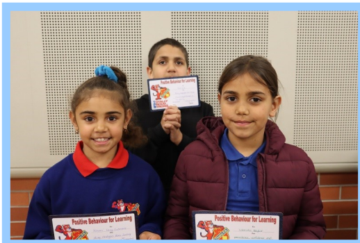
PBL Award Recipients

Earlier in the year the school received a donation of cereal. All students had an opportunity to take home boxes of cereal last week. The students are very appreciative of the kindness shown to them.