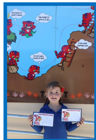
PBL Award Recipients