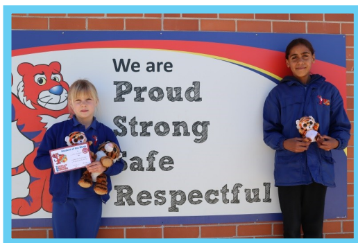
Student of the Week & PBL Ticket Recipients