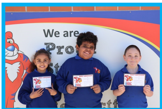
Merit Award Recipients