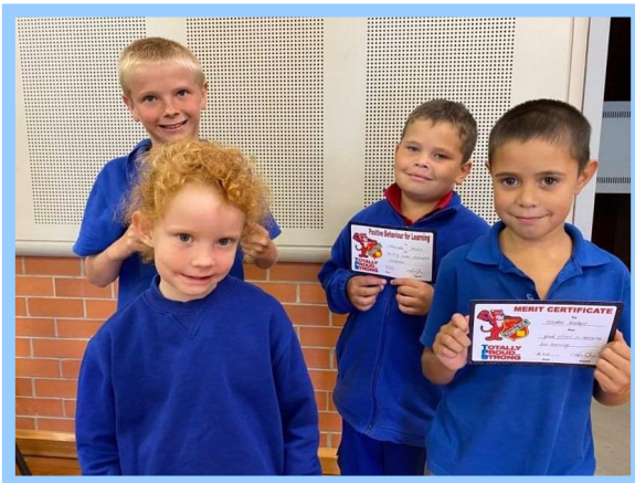
PBL & Merit Award Recipients

If your details have changed eg: phone number, address or emergency contacts. Please ring the office to update on 67 233 437. Thank you