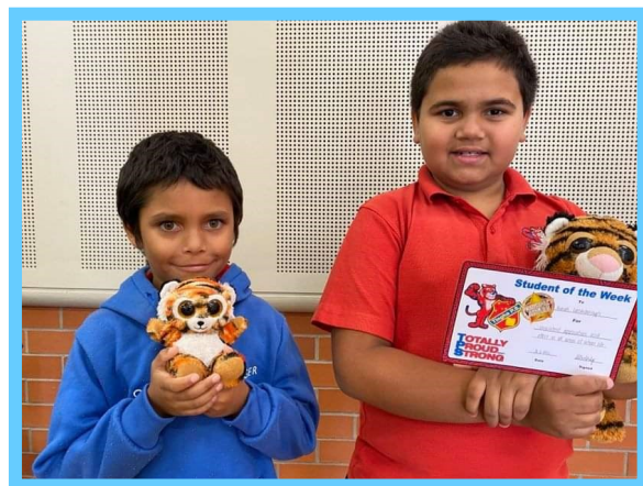
Student of the Week and PBL Bear Recipients