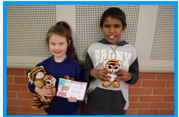
Student of the Week & PBL Bear Recipients