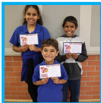
Merit Award Recipients