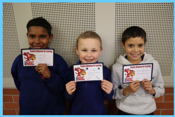
PBL Award Recipients

If your details have changed eg: phone number, address or emergency contacts. Please ring the office to update on 67 233 437. Thank you